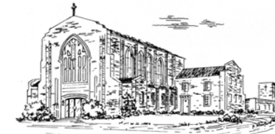
FIRST UNITED METHODIST CHURCH IN LEXINGTON, TENNESSEE